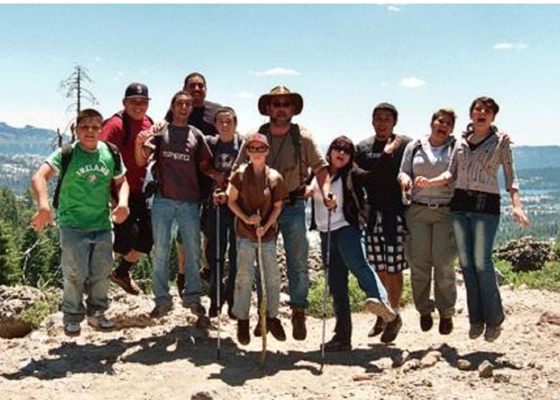
Above: The CFM 2009 Camping trip was to Alpine Lake, in California's Gold Rush Country. Besides hiking and swimming, campers learned they are God's special treasure, and how to live for eternal things that will never lose their value.